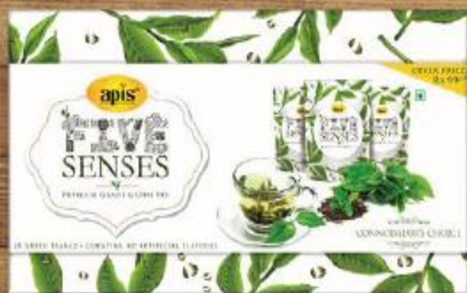
Apis Green Tea Net Wt. 50gm