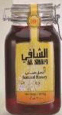
Net Wt. 1kg Also available in 2kg bucket