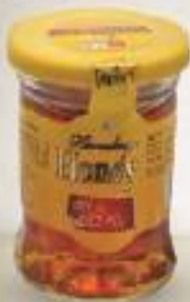
Net Wt. 50g