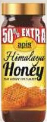
Net Wt. 1kg + 500gm extra Also available in 375 gm and 125 gm