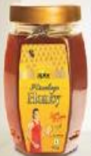
Net Wt. 500g Also available in 1Kg and 100gm