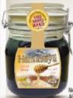
Net Wt. 1kg Also available in 500g