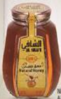
Net Wt. 500g Also available in 750 gm