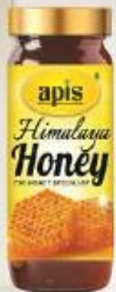
Net Wt. 1kg