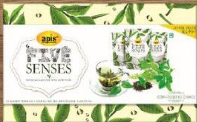
Apis Green Tea with Turki Net Wt. 50gm