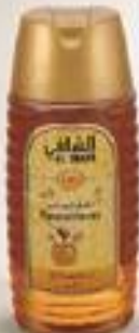
Net Wt. 500g