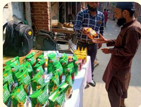
On Ground Market Activity