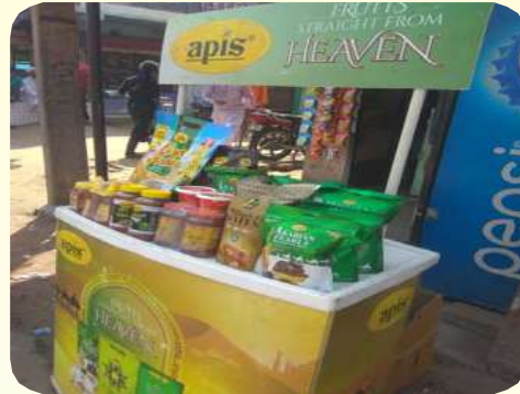
On Ground Market Activity