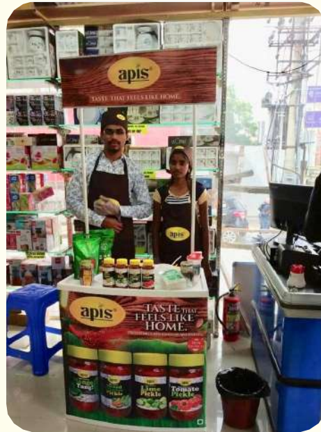
Pickle Launch Activation